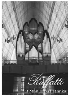
Fratelli Ruffatti Pipe Organs Padua, Italy

RODGERS® DIGITAL ORGANS PIPE-COMBINATION ORGANS