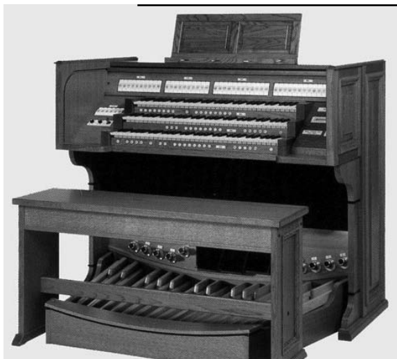
Makin Westmorland Series 41 All Saints Episcopal Church Crescentville Road Philadelphia, Pennsylvania

European quality and design now in America